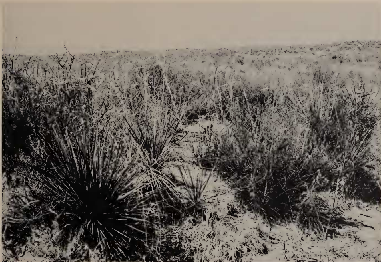
FIG. 6.—Mixed grass-yucca community, north of Fieldton, Lamb County.